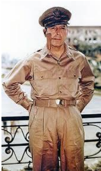
General Douglas MacArthur

General of the Army Douglas MacArthur (26 January 1880 – 5 April 1964) was an American general and field marshal of the Philippine Army . He was a Chief of Staff of the United States Army during the 1930s and played a prominent role in the Pacific theater during World War II. He received the Medal of Honor for his service in the Philippines Campaign . Arthur MacArthur, Jr. , and Douglas MacArthur were the first father and son to each be awarded the medal. He was one of only five men ever to rise to the rank of General of the Army in the U.S. Army, and the only man ever to become a field marshal in the Philippine Army.